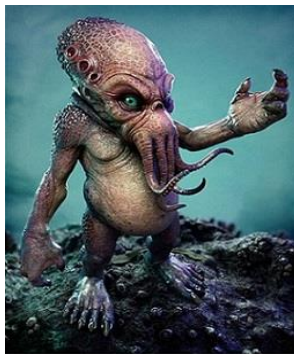
Does your resistance seem like a monster?