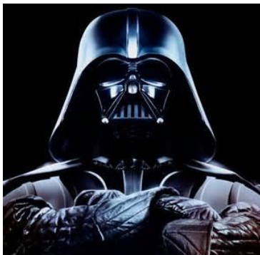
Does your resistance intimidate you?

Practice: Become aware of your thinking. Challenge your thoughts and beliefs. Generate alternatives, considering where the alternatives will lead you. Act on them. Use your courage.