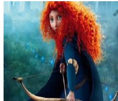
Be brave, have courage.

Let's consider the example we started last month. The thoughts, feelings and conclusion are: